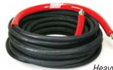
Heavy-duty, high-pressure hoses in lengths up to 150-ft.