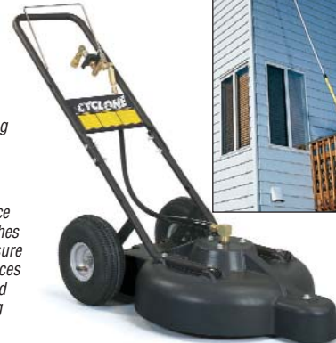
Rotary surface cleaner attaches to your pressure washer; reduces overspray and zebra striping

Telescoping wands extend to 24' to reach high places without scaffolding